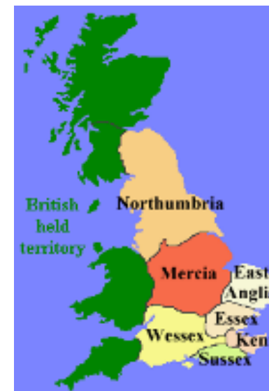
This is a map of the UK, showing the seven kingdoms ruled by the Anglo-Saxons and the kingdoms ruled by Britons.